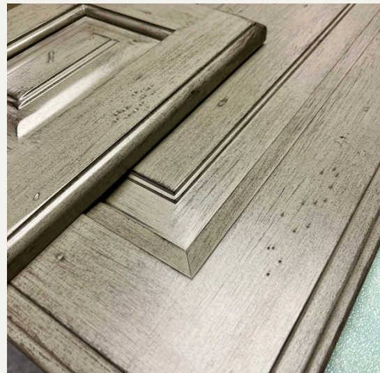
HAND APPLIED DISTRESSING AND GLAZING