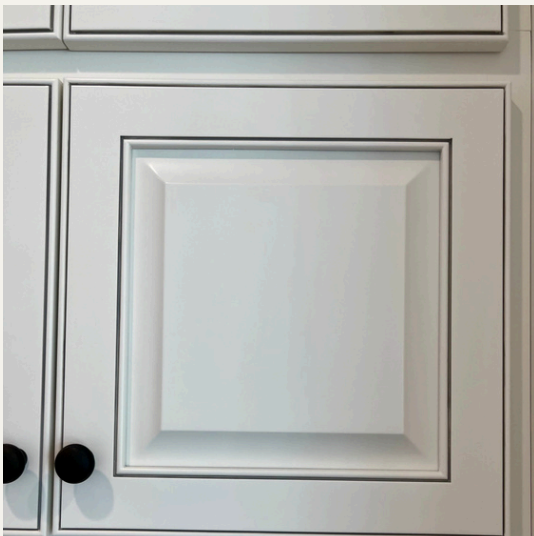
HAND APPLIED GLAZE IN RECESSES